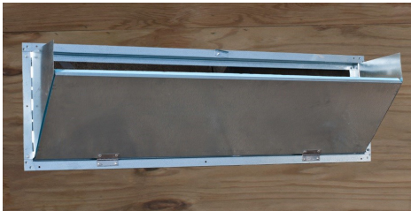
Large Galvanized Inlet with Side Flaps

Sidewall doors with side deflectors to help direct air toward ceiling.