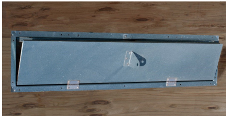
Small Galvanized Inlet

Fold out flap for winch connection. Equipped with door lock latches to keep doors closed.