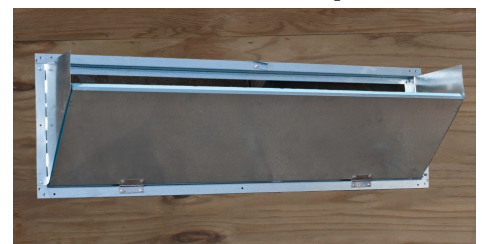
Large Galvanized Inlet with Side Flaps

Sidewall doors with side deflectors to help direct air toward ceiling.