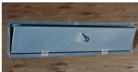
Small Galvanized Inlet

Fold out flap for winch connection. Equipped with door lock latches to keep doors closed.