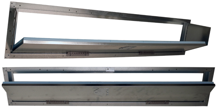
Insulated Sidewall Inlet with Air Deflector

Our inlet doors and vent doors can be used with all the hog barn evaporative cooling systems we offer, to bring fresh air into your building.