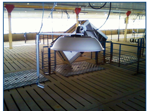
An L.B. White ® forced air heater and radiant heat brooder with Smart Sense ® .

“ I know L.B. White Smart Sense heaters are saving money in my facility even without calculating the exact difference in fuel usage between Smart Sense and standard heaters. On the coldest days of the year, the Smart Sense heaters never run at 100% output and they still maintain temperature set-point. You can feel the low output when standing next to the heater, which is confirmed by the percent output readings on the control. The Smart Sense heaters run over a prolonged period to create a more even air quality in the room, and this is reflected in the temperature probe readings. The heaters clearly assist in overall air quality by circulating the air in the rooms to achieve uniform air temperature.”