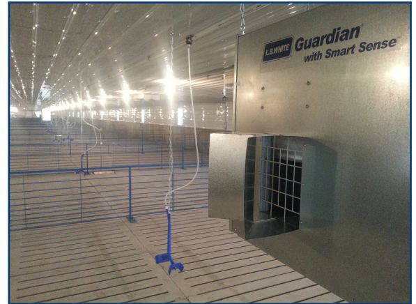
A Guardian® forced air heater with Smart Sense®.

Smart Sense® allows the heater to run longer at lower firing rates and become part of the circulation system. This results in a much more consistent room temperature.